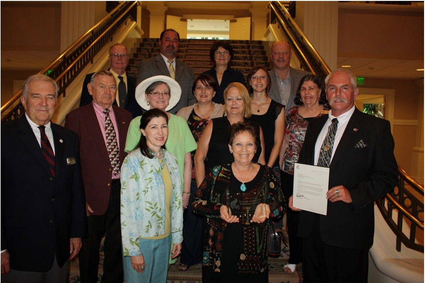
Our team at the Arkansas Governor's Mansion, 07/20/2012.